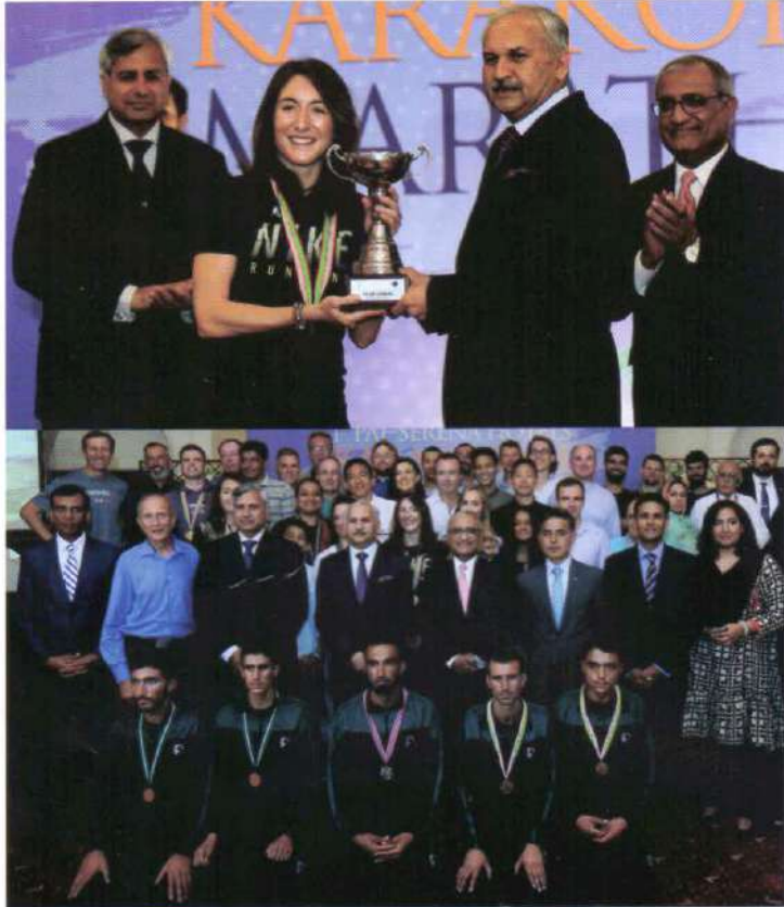
Air Chief Marshal Mujahid Anwar Khan, Chief of the Air Staff, Pakistan Air Force along with the medal winners of first International Karakoram Marathon

Chief of the Air Staff, Air Chief Marshal Mujahid Anwar Khan valley into a hub of winter sports and this scenic place